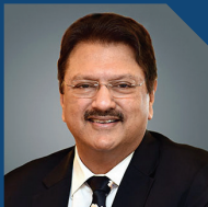
Mr. Ajay Piramal President, Anant National University Chairman, Piramal Group